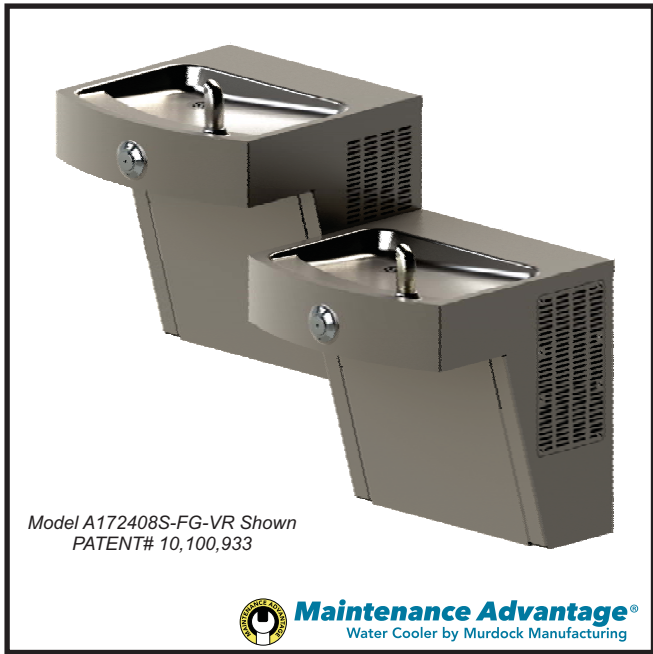
Model A172408S-FG-VR Shown PATENT# 10,100,933

Maintenance Advantage® Water Cooler by Murdock Manufacturing